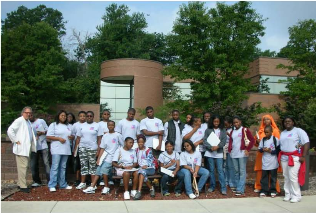
2007 TRANSIT Campers at Road Commission for Oakland County-TOC