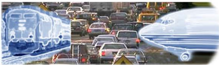
Alternate energy and system mobility to stimulate economic development.

Dr. Nizar Al-Holou of UDM's Department of Electrical and Computer Engineering has been approved to undertake a project that addresses the challenge of developing a test bed that accommodates testing different inter-vehicle communication protocols and yet keeps the cost at a reasonable level. The result will be a versatile test bed with realistic measurements at a low cost that will be used to evaluate different wireless protocols. There are many difficulties involved in building such a test bed, including: the draft, and continuously updated, status of the proposed inter-vehicle communication protocols; the large number of nodes that are required to reflect a real world scenario of inter-vehicle communication; and the high cost of the available tools in this field. The proposed test bed will provide a tool to investigate minimizing message delay, obtaining sufficient channel throughput, and evaluating real world inter-vehicle communication scenarios with actual vehicles.