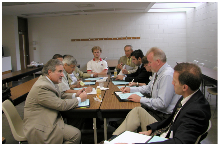
During the Intelligent Transportation Society of Michigan summer meeting the attendees split into Break-out Sessions to explore transportation issues.